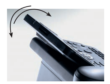
Fully adjustable display for a clear and comfortable viewing angle, from wherever you're looking.